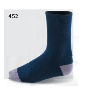
6WWS Work Sock (3 Pack)