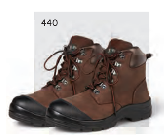
9F4 Lace Up Safety Boot