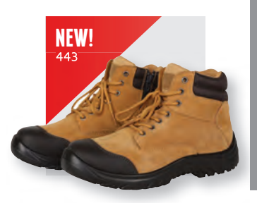
9F9 Steeler Zip Safety Boot