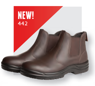
9F8 Traditional Soft Toe Boot