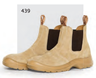
9E1 Elastic Sided Boot