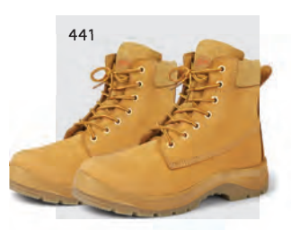
9F5 Lace Up Outdoor Boot