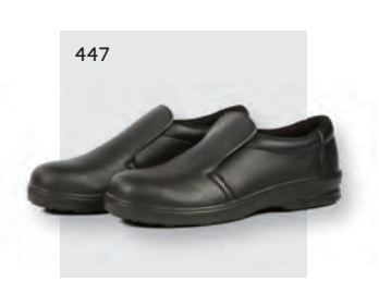
9C2 Microfibre Shoe