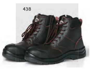
9F2 5" Zip Boot