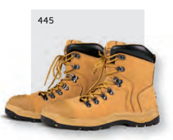
9F7 7 Eyelet Lace Up Boot