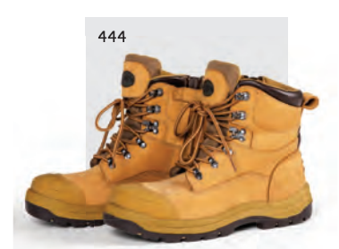
9F1 Side Zip Boot