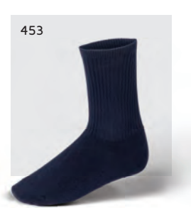
6WWSE Every Day Sock (2 Pack)