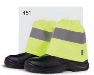
9EAR Reflective Boot Cover